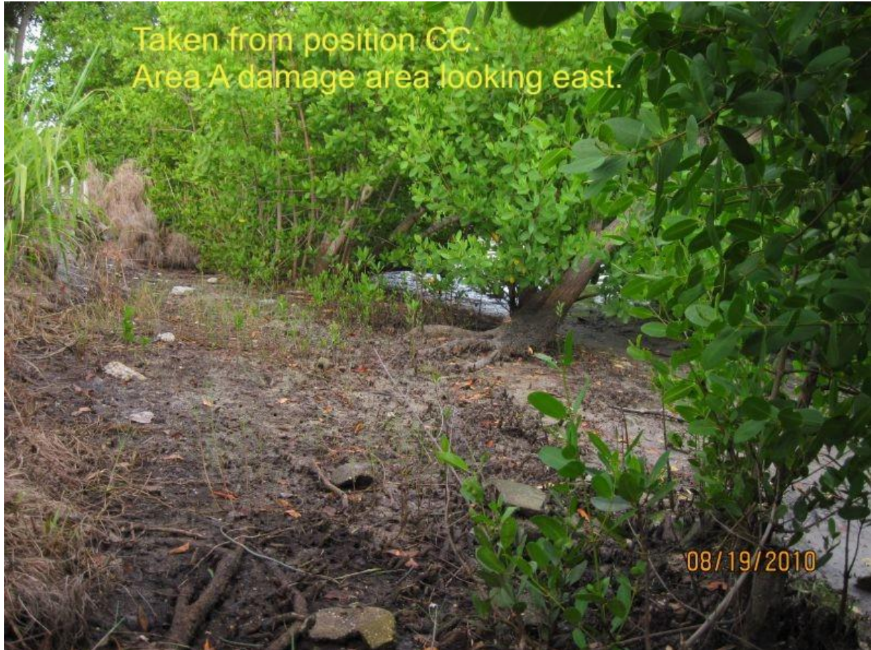
This was taken at position CC, standing just above the low tide water line, leaning against the south most Australian pine stump at the west end of Area B. It shows the damage area in Area A.