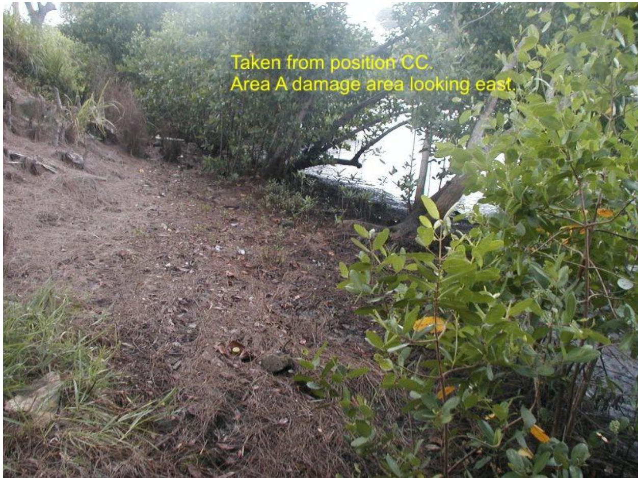
This was taken at position CC, standing just above the low tide water line, leaning against the south most Australian pine at the west end of Area B. It shows the damage area in Area A.