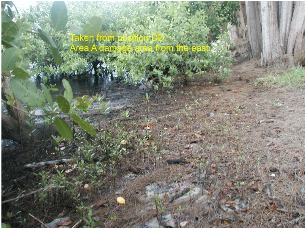
Same area of damaged mangroves as the previous photo but taken from the west at a position just below the oak tree on the bank at the east end of Area A, position DD on the sketch.